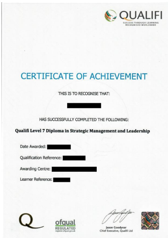
QUALIFI Level 7 Certificate